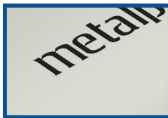
MATTE non-reflective with dull finish