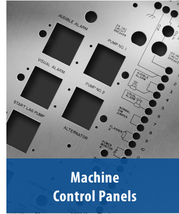
UID Labels / Nameplates