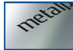
GLOSS highly reflective, mirror-like